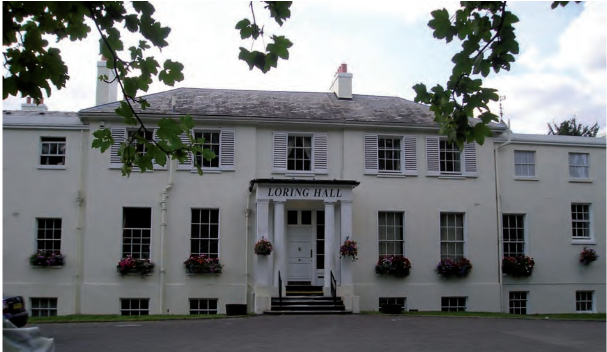
Loring Hall built circa 1760 Grade II Listed

7.8 Whilst clearly it is the group as a whole that contribute to the character of the conservation area, it is still worth making reference to one or two buildings as distinct examples of exemplar architectural style. In this respect Loring Hall and The Dower House, also a local landmark building, make a significant contribution to the area. Similarly, The White Cross Public House represents a good example of a local landmark building.