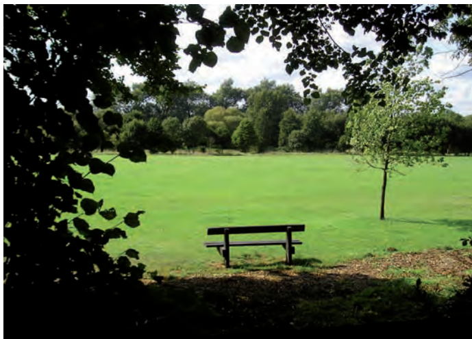
Foots Cray Meadows from Leafield Lane