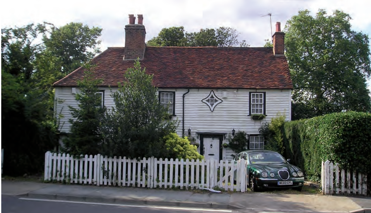
Nos. 152 and 154 North Cray Road - Grade II Listed

7.4 Adjacent to the White Cross are two timber-framed cottages (Nos.152 and 154 North Cray Road, Grade II Listed). These cottages probably date from the 16th or 17th Century. With their weather-boarded walls and tiled roofs they provide a reminder of the local vernacular that characterised the medieval Kent countryside.