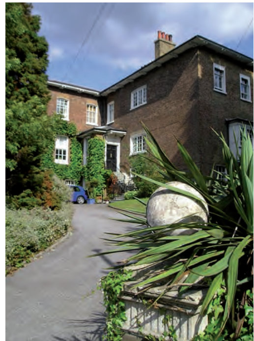
The Dower House

7.10 Green spaces within the conservation area and around the existing built environment contribute to its ambiance and rural character forming a network of biodiverse corridors that are inter-connected to the Cray River valley. These spaces, including private front and back gardens and the wooded areas within Leafield Lane and Water Lane, are important characteristics, which are intrinsic to the appearance of the conservation area.