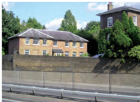
Road and wall separates Dower House from the rest of the conservation area