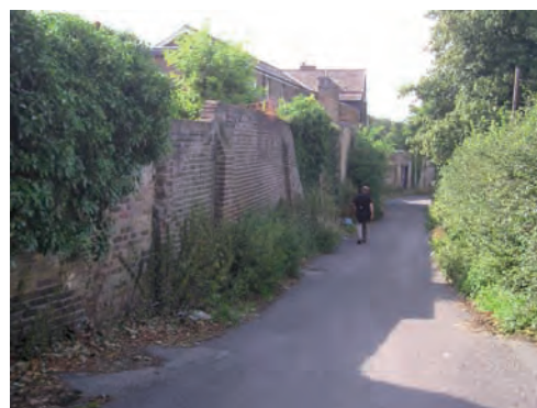
View west along Water Lane showing the rural character of the area