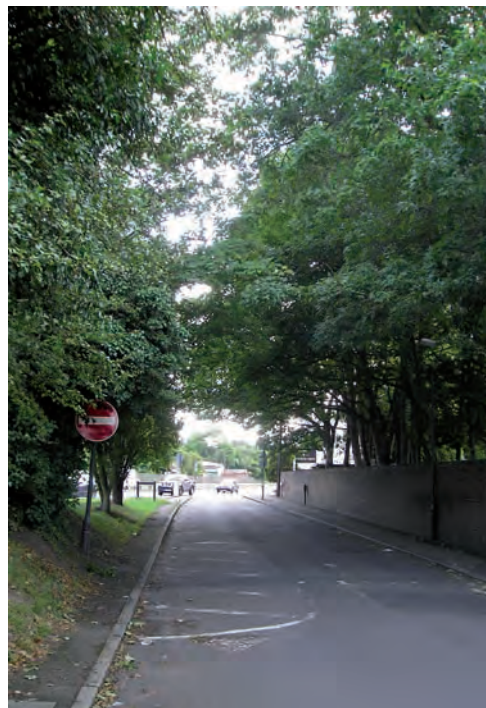
Trees in Water Lane at the entrance to Loring Hall