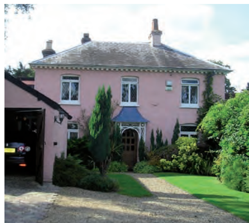
Pear Tree Cottage

7.5 Further to the south, another notable building is Pear Tree Cottage (No.166 North Cray Road, circa 1790) is a locally listed building. This cottage has walls of painted brick and a low hipped slate roof. The central doorway has a fine Victorian wrought iron porch, whilst the windows are leaded-light casements. This building contrasts with the orange-red bricks and steep tiled roof of the former Church of England school on the adjacent site (Nos. 168 -170 North Cray Road), now converted into two houses. The building dates from 1860 and saw use as the village school until 1959.