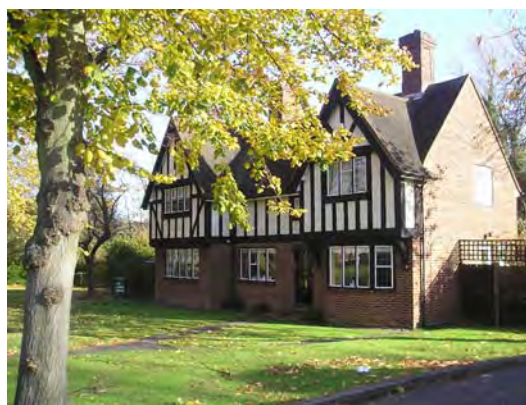
1 & 2, The Cottages, The Green

7.22 As set out above, green spaces form a significant feature in the conservation area. In the residential areas this primarily comprises front gardens and road side trees. The private garden areas around the junction of The Park and Chislehurst Road have been included in the conservation area as they are contiguous with the larger open green area and contribute significantly to the conservation area and the streetscape setting at this particular location.