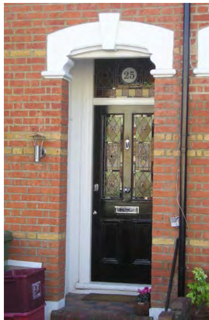
Detailing, Church Avenue