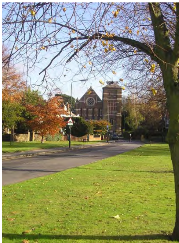
St. John's Church, looking eastwards along The Green