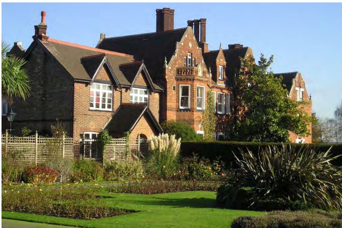
Sidcup Place from the walled garden