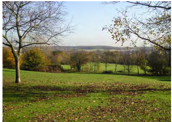
View from Sidcup Place across the Cray Valley