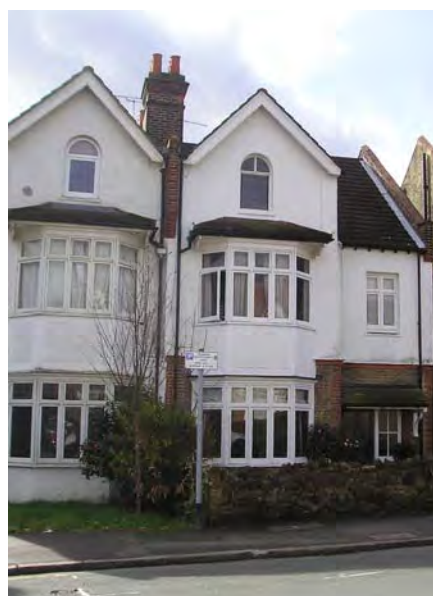
15 & 17, Church Avenue