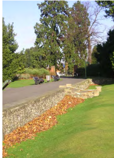
The ha-ha at Sidcup Place

7.6 As briefly described above, the buildings associated with The Green character area are a diverse group of buildings of different periods, each of the individual buildings contribute significantly to the character and appearance of the conservation area. Other principle features include private gardens with landscaping, trees and the views and spaces between these buildings.