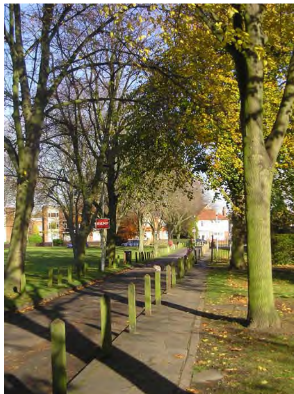
The Green, tree-lined access road to Sidcup Place