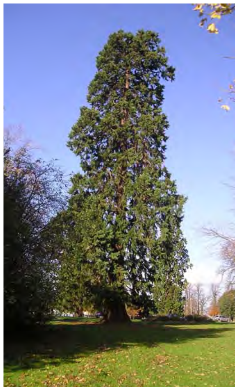
One of the giant redwood (sequoia) trees at Sidcup Place

7.29 There needs to be greater consistency of front boundary detailing, where it should reflect original design.