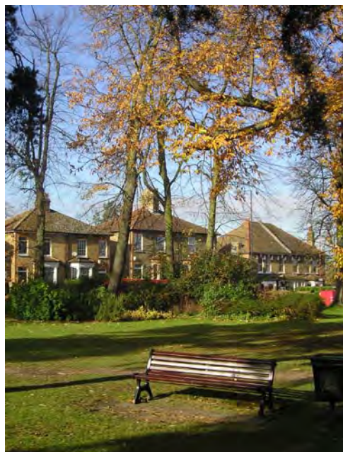
Elm Road from Manor House