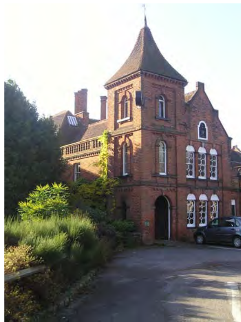
The imposing entrance to Sidcup Place

7.20 The area contains 5 statutorily Listed Grade II buildings/structures, these are Place Cottage; the Sheffield Monument (St John's Churchyard); Manor House; Sidcup Place; and St John's Church, the latter three are considered to be Landmark Buildings within the conservation area. Local List buildings in the area include Red Lodge on Chislehurst Road; the kitchen garden wall to Sidcup Place; 1,2, 3 and Freeby on The Green; and the War Memorial.