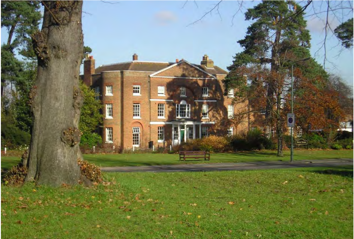
Manor House in the setting of Sidcup Green