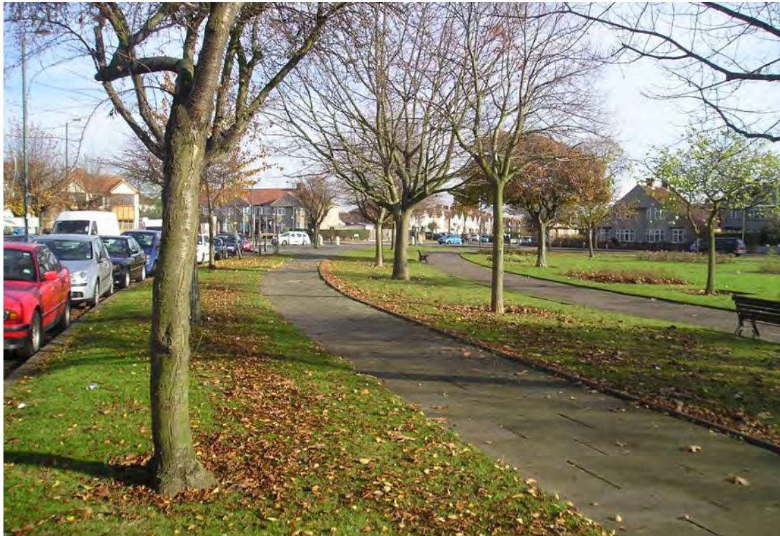
Designated conservation area boundary