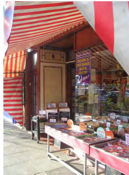
Traditional shop front (No.25)

7.17 Trees make a positive contribution to the setting of the conservation area, especially those that have been placed on the wide pavement fronting the shops. These trees, when in leaf, become a prominent feature and make a positive contribution to the conservation area.